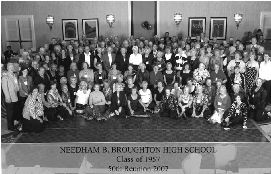
NEEDHAM B. BROUGHTON HIGH SCHOOL Class of 1957 50th Reunion 2007

Broughton's Class of 1957 celebrated its 50th reunion on September 28-29, with 145 class members and 90 guests gathering at the Crabtree Marriott for a memorable weekend.