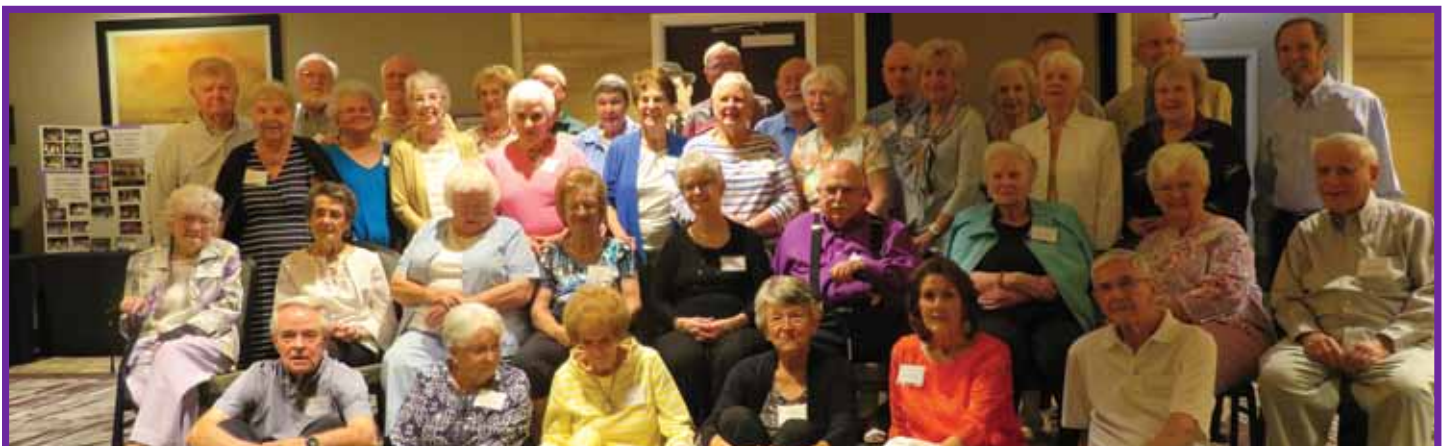
And here we are