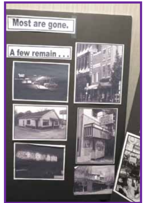
The way it used to be

Do you remember the huge display of Ready Kilowatt and the Planters Peanut sign? And of course, there