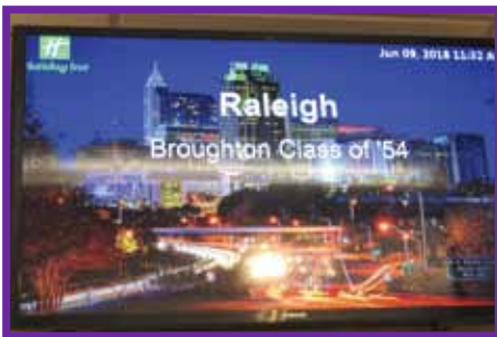
Elvis is in the house

Our weekend of fun began with a social Friday evening and concluded with a "formal" dinner Saturday night. In between, there was ample time to talk, listen and share memories of our days at Broughton and our individual experiences since then.