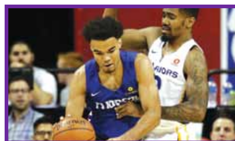
Photo credits: Graham - Bart Young/Getty Images; Robinson – www.latimes.com