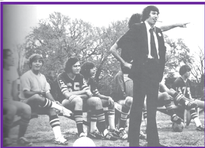
Caps watch a game in the inaugural soccer season

Soccer’s first year as a varsity sport – “Soccer, in its first season as a varsity sport, rates as Broughton’s newest and least understood sport. Soccer is an exciting, fast moving game that takes much skill, agility and great endurance.”