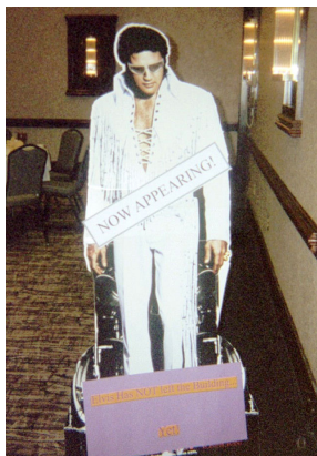
Invited guest - guess who?

A jukebox playing our favorite high school days hits with Elvis looking on greeted the Class of '54 alums to start their 55 th reunion. Fifty members strong, we came to the Sheraton Imperial on the weekend of July 24 th from as far away as Ontario, Canada; Georgia, Texas, California, Tennessee, Vermont, Kentucky, Maryland and Florida.